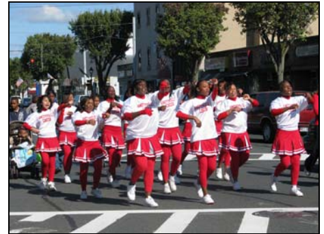
Cheerleaders Lead the Parade