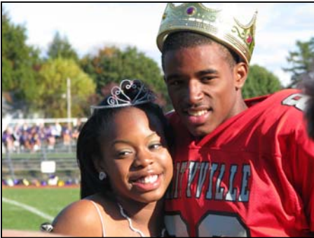
Homecoming Queen & King

Spirit Week, the Pep Rally, the Homecoming Parade, and the football games were all a great success!